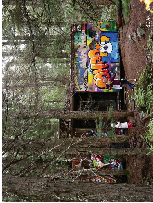
BC Ale Trail