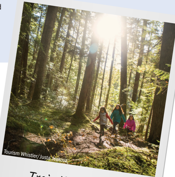
Train Wreck Trail